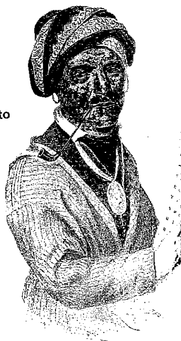
Sequoya invented writing system of 86 characters, shown here, for the Cherokee language

Sequoya hoped that by gaining literacy—the ability to read and write—his people could share the power of whites and keep their independence. But even Sequoya's invention could not save the Cherokees from the upheaval to come. In this section, you will learn about President Jackson's policy toward Native Americans and its effects.